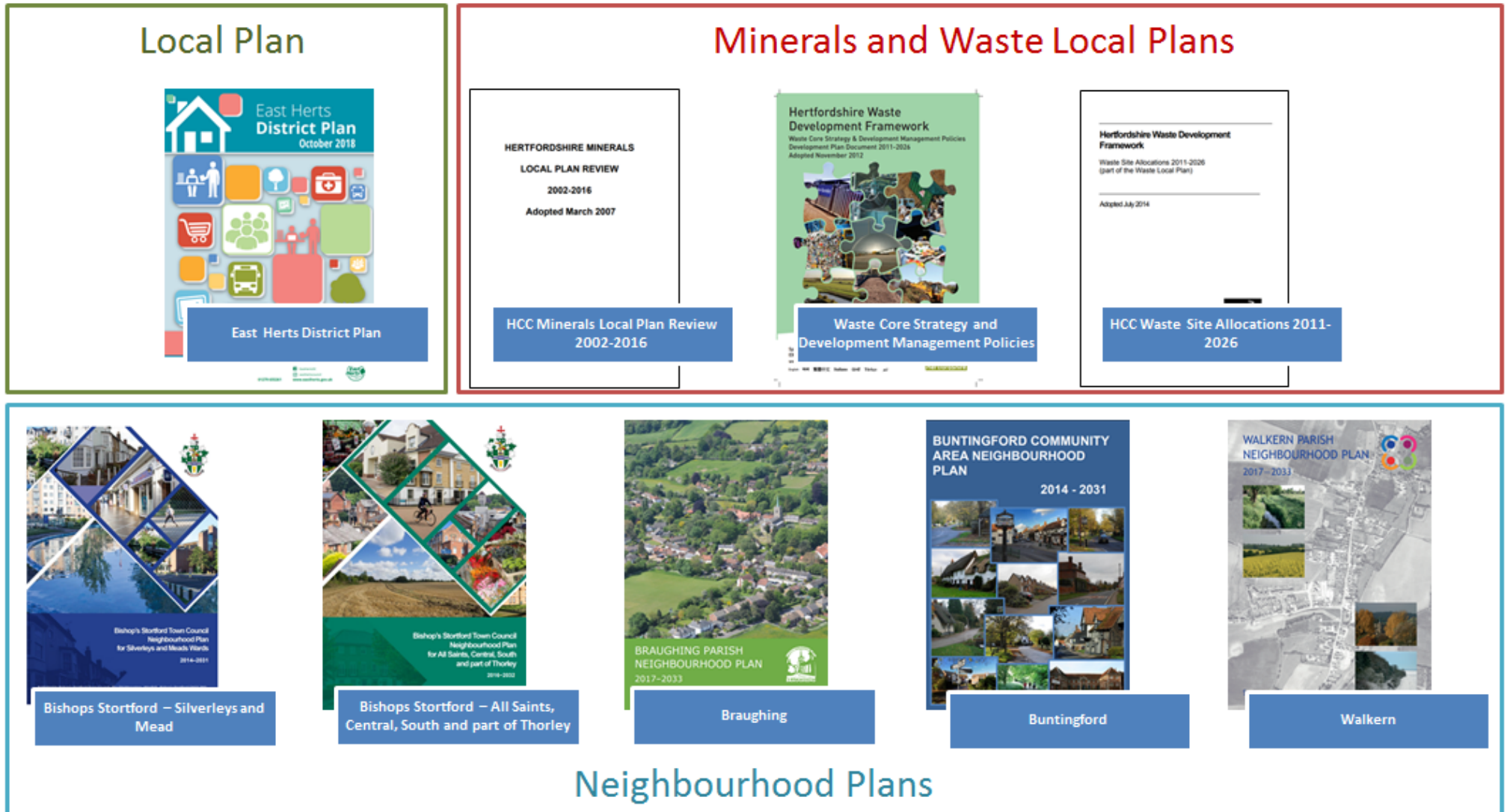
Figure 1: A visual representation of the Development Plan Documents